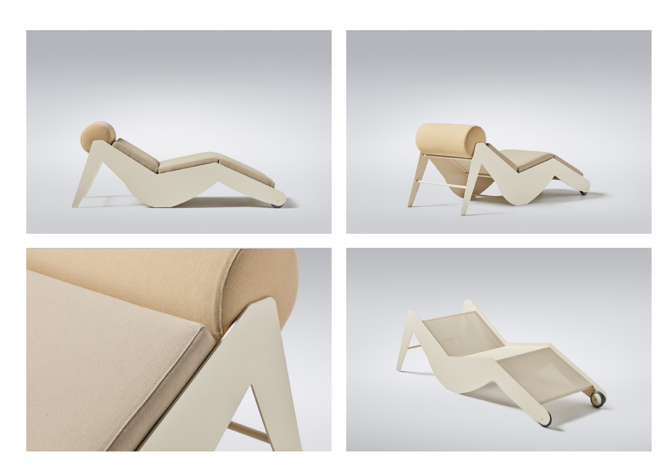
MATERIALS - Aluminium Frame - Outdoor Foam & Fabric

Lola combines artistry and functionality in equal measure. Its clean, intentional lines evoke a sense of elegance and purpose, while its durable design makes it equally suited to both indoor and outdoor spaces. Whether placed poolside, in a sunroom, or within a curated interior setting, Lola is designed to be lived with, admired, and interacted with. We wanted Lola to be admired all year round, both indoors and out, so its materiality was crucial. The aluminum frame allows it to with stand the elements all year round whilst also making it structurally sound and lightweight. Theremovable Urecel foam cushion allows for quick drying and is upholstered in 100% solution-dyed fabric, suitable for high UV climates.